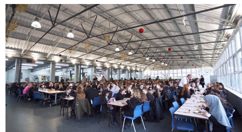
Our Bistro seats 400 students.

The school operates a cashless cafeteria system. Money can be added to student's accounts online only using 'WisePay'. Details are available on the school website.